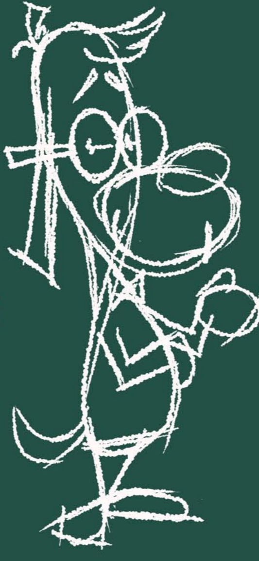
8. ...eyes, eyebrows and glasses...