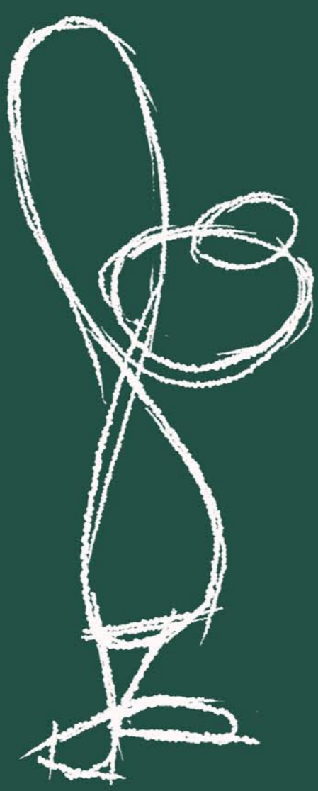
4. add the feet