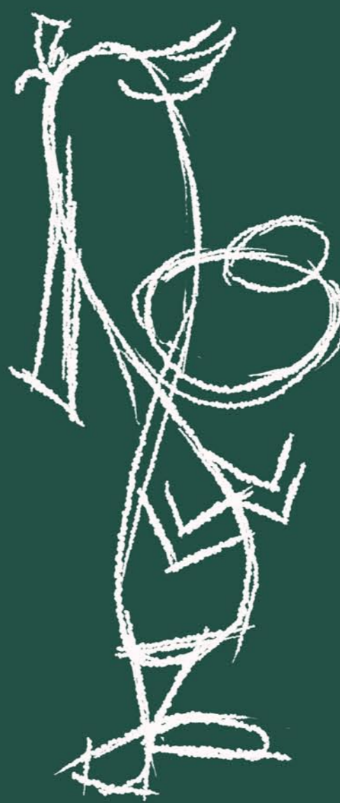
6. Two "L" shapes make the arms