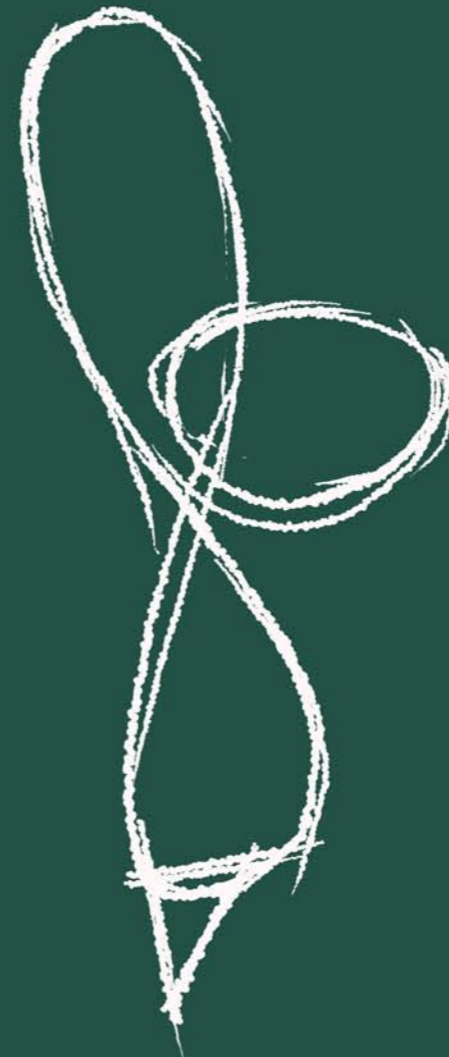
3. and a triangle for the legs