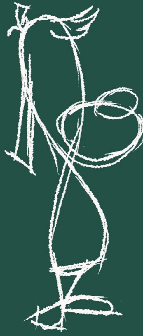
5. add ears and hair tufts