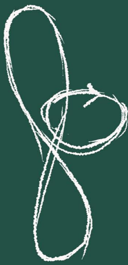
2. Block in an oval snout