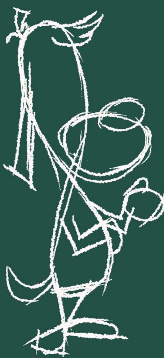
7. add paws and tail